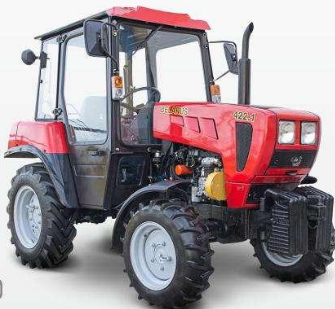
BELARUS - 422.1