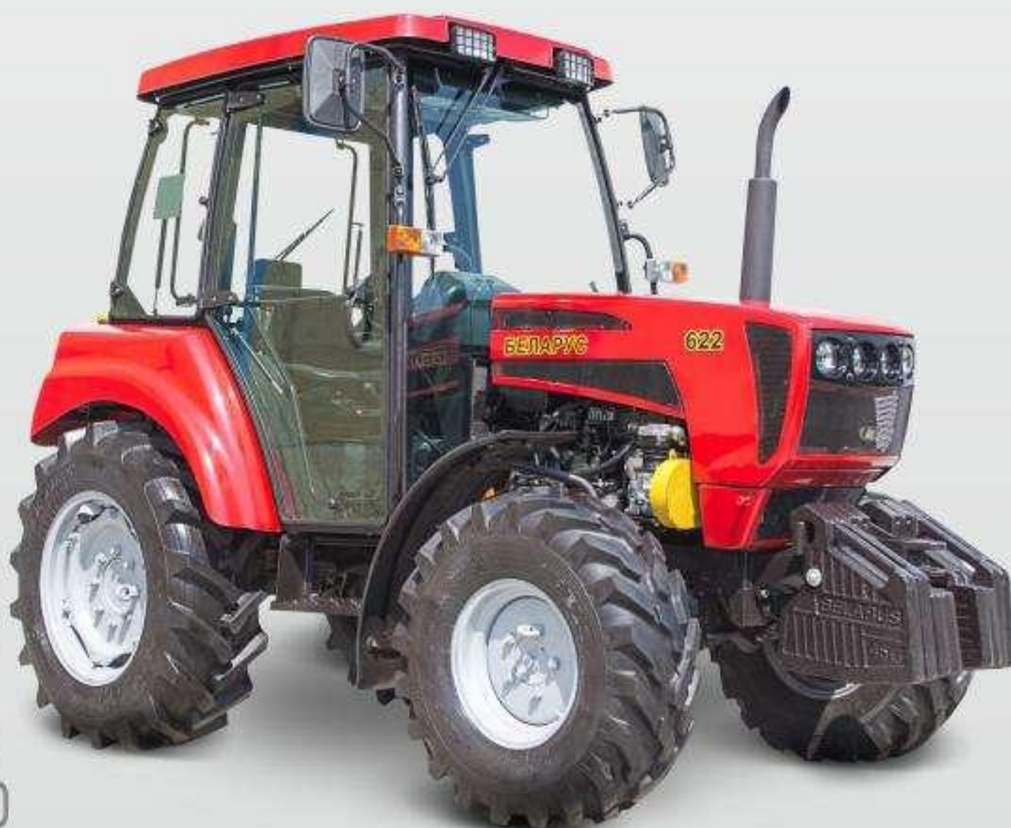
BELARUS - 622