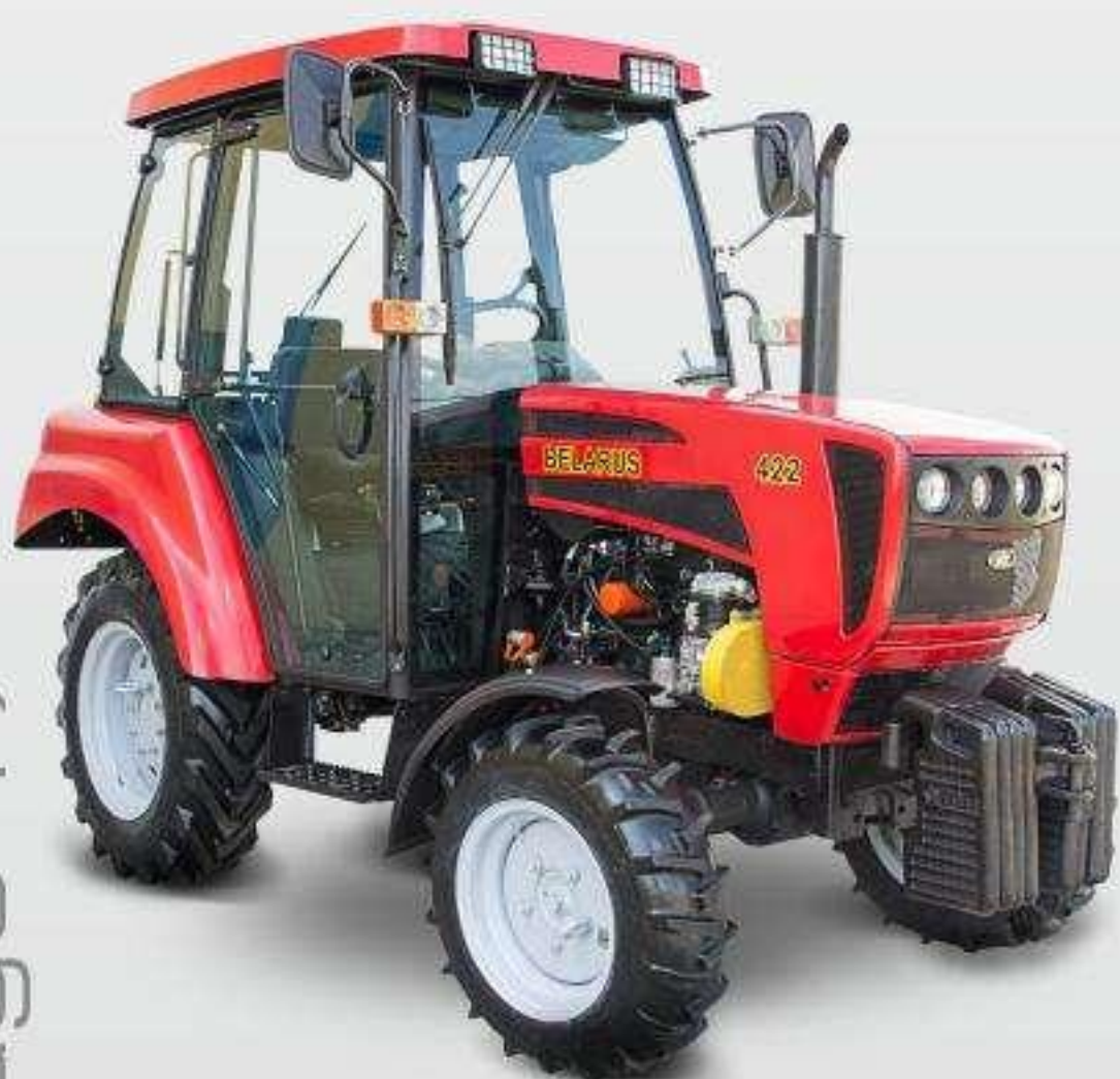
BELARUS - 422