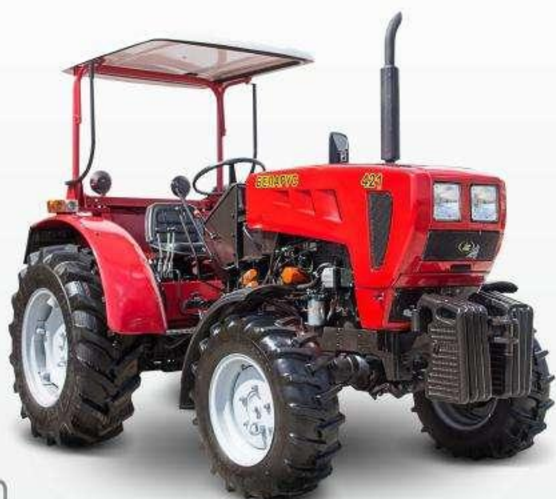
BELARUS - 421 BELARUS - 410